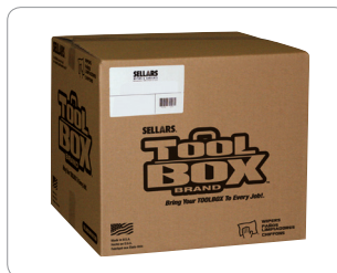
Z700 Jumbo Roll Outer Case

*Wypall is a registered trademark of Kimberly-Clark Worldwide Inc.