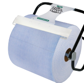
Wall Mount Jumbo Roll Dispenser Product #: 99914

Z700 JUMBO ROLL Wipers are compatible with: