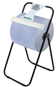
Floor Stand Jumbo Roll Dispenser Product #: 99911