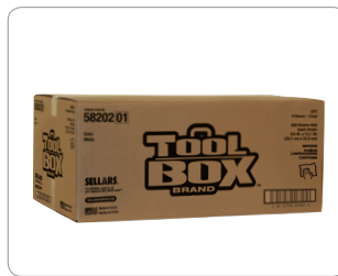
White Rags Center-Pull Outer Case

*SCOTT is a registered trademark of Kimberly-Clark Worldwide Inc.