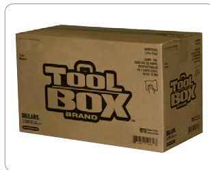
Z400 BIG GRIP® Bucket Outer Case

Covered under U.S. & foreign patents & other patents pending... U.S. Patent #D504,794S, #D522,780S, CA 107904, MX 19947, EU Patent #267349-001