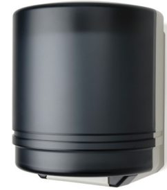
Center Pull Towel Dispenser Product #: 99906 Units/Case: 2

Uses: Ideal for medium duty general purpose wiping applications