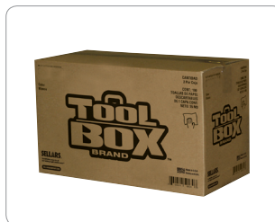
Z400 GREENX™ Series Big Grip® Bucket Outer Case

*WYPALL is a registered trademark of Kimberly-Clark Worldwide Inc.