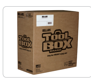
Z400 Blue Interfold Outer Case

*SCOTT is a registered trademark of Kimberly-Clark Worldwide Inc.