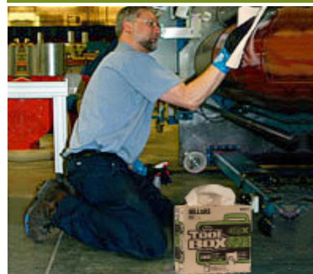
Compare to WYPALL* L40 Wipers

Uses: Ideal for medium duty general purpose wiping applications