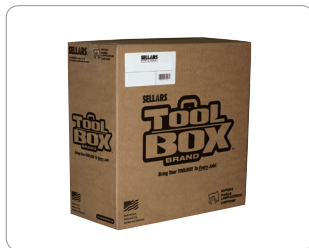
Z400 GREENX™ Series Interfold Outer Case

*WYPALL is a registered trademark of Kimberly-Clark Worldwide Inc.