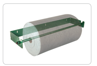
Compatible with Wall Mount Absorbent Roll Dispenser Product #: 99915

Caution: Not intended for use with aggressive acids or caustics. Dispose of all sorbent materials in accordance with local, state and