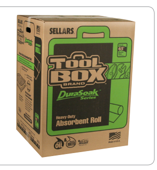
DuraSoak™ Split Rolls Outer Case

Caution: Not intended for use with aggressive acids or caustics. Dispose of all sorbent materials in accordance with local, state and federal regulations.