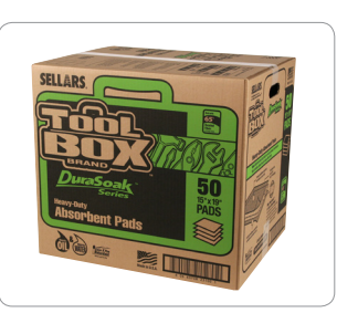
DuraSoak™ Pads Outer Case

Caution: Not intended for use with aggressive acids or caustics. Dispose of all sorbent materials in accordance with local, state and federal regulations.