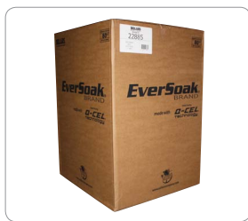
Basic Split Rolls Outer Case