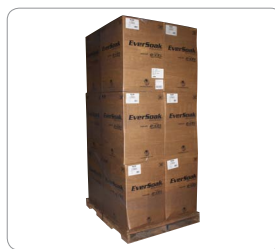
Basic Split Rolls Outer Case on a Pallet

To order, contact your Authorized Sellars® Distributor