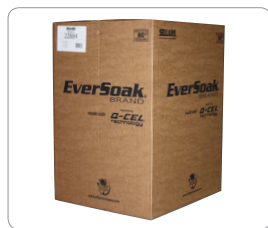
Basic Roll Outer Case