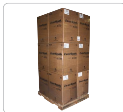
Basic Roll Outer Case on a Pallet

To order, contact your Authorized Sellars® Distributor