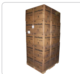
Basic Pads Outer Case on a Pallet