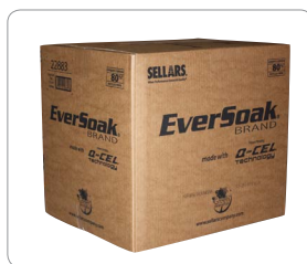
Basic Pads Outer Case

Caution: Not intended for use with aggressive acids or caustics. Dispose of all sorbent materials in accordance with local, state and federal regulations.