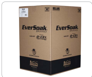
STANDARD Roll Outer Case