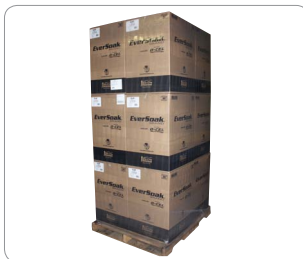
STANDARD Roll Outer Case on a Pallet

To order, contact your Authorized Sellars® Distributor