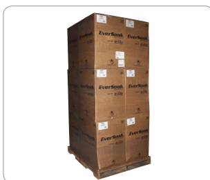
Preferred Split Roll Outer Case on a Pallet