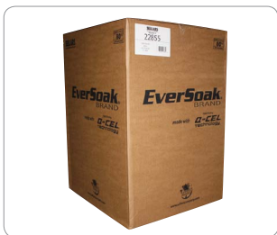
Preferred Split Roll Outer Case

Caution: Not intended for use with aggressive acids or caustics. Dispose of all sorbent materials in accordance with local, state and federal regulations.