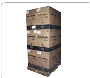
Preferred Roll Outer Case on a Pallet