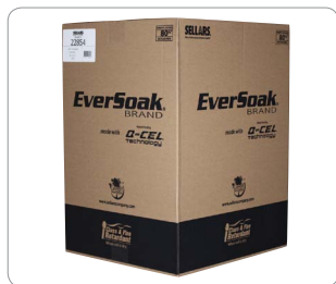
Preferred Roll Outer Case

Caution: Not intended for use with aggressive acids or caustics. Dispose of all sorbent materials in accordance with local, state and federal regulations.