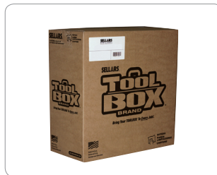
Z300 IGREENX™ Series Interfold Outer Case