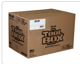
Z300 GREENX™ Series ¼ Fold Outer Case