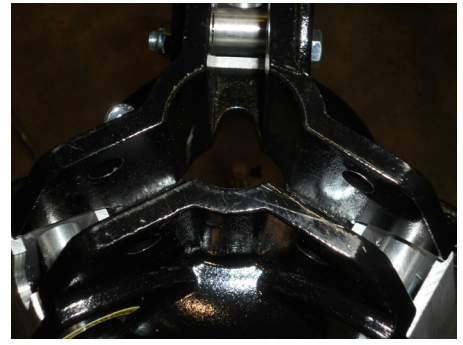
(Top of tripod with pulleys removed)