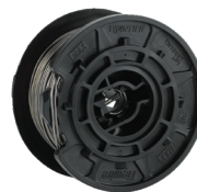
19 ga. Steel Wire