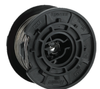
19 ga. Buy American Wire

TW1061T-S- STAINLESS STEEL WIRE IS ALSO AVAILABLE AS A SPECIAL ORDER ITEM.