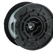
19 ga. Electro. Galvanized Wire