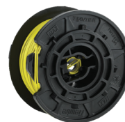
19 ga. Poly Coated Wire