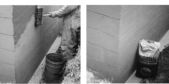
Brush it on. Level it out. Apply second coat. Sealed and waterproofed.