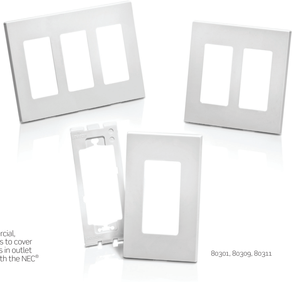
80301, 80309, 80311

For Decora Plus™ and Decora® Wiring Devices