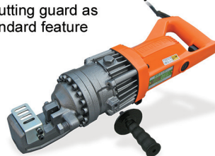
PRODUCT No. DESCRIPTION DC-16W Portable Rebar Cutter