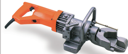
PRODUCT No. DESCRIPTION HB-16W Portable Rebar Bender