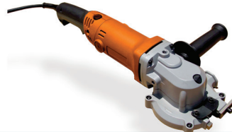
PRODUCT No. DESCRIPTION BNCE-20 Cutting Edge Saw™

Includes: 2 TCT cutting blades, extra set of motor carbon brushes, removable side handle, chip collector attachment, tool kit, and operations manual with a plastic molded carrying case.