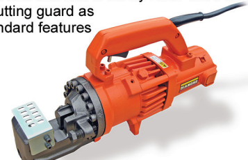
PRODUCT No. DESCRIPTION DC-20WH Portable Rebar Cutter