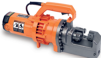
PRODUCT No. DESCRIPTION DC-25X Portable Rebar Cutter