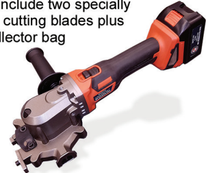
PRODUCT No. DESCRIPTION BNCE-20-24V Cordless Cutting Edge Saw™