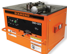
PRODUCT No. DESCRIPTION DBD-32X Portable Rebar Bender

Includes: Hands free foot pedal and a complete set of roller dies