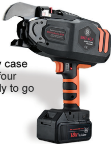
PRODUCT No. DESCRIPTION BNT-40X Portable Rebar Tying Tool