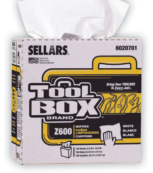
Inner Box Length: 10" Width: 4.4" Height: 9.8"

1 Less Than Truckload (LTL) Truckload (TL)