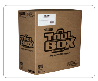
Z600 Interfold Outer Case

*WYPALL is a registered trademark of Kimberly-Clark Worldwide Inc.