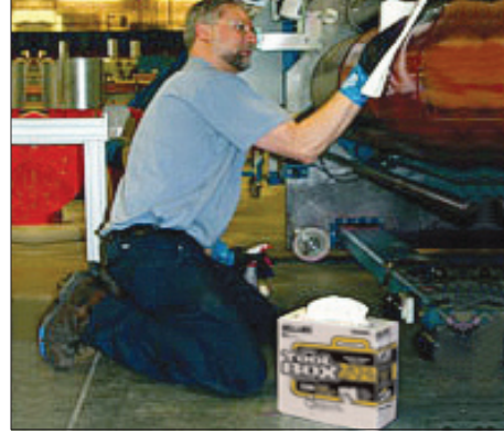
Compare to WYPALL* X60 Wipers

Uses: Perfect for medium duty wet or dry wiping applications