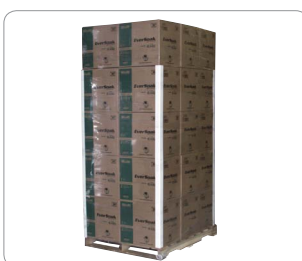
Preferred Pads Outer Case on a Pallet