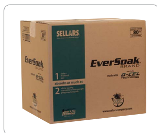
Preferred Pads Outer Case

Caution: Not intended for use with aggressive acids or caustics. Dispose of all sorbent materials in accordance with local, state and federal regulations.