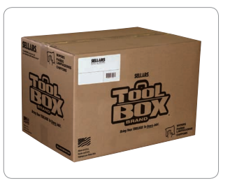
Z300 ¼ Fold Outer Case