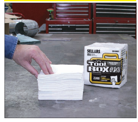
Compare to WYPALL* L30 Wipers

Uses: Ideal for light duty general purpose wiping