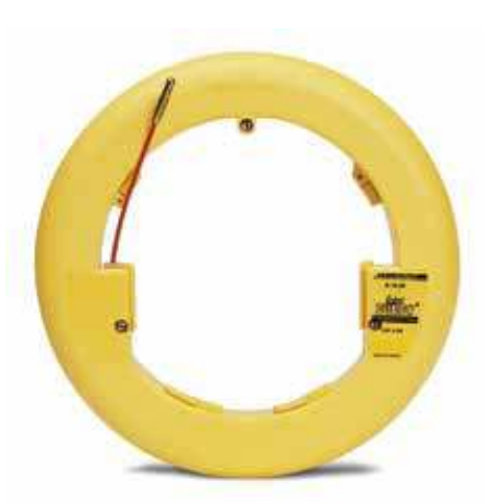
Without Accessory Kit