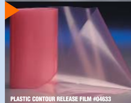
PLASTIC CONTOUR RELEASE FILM #04633

Film to be overlaid on speedgrip adhesive just after it has been applied to prevent air entrapment. Use this Plastic Contour Release Film to force the bead of SpeedGrip adhesive into the groove and shape it closely to the original contour.