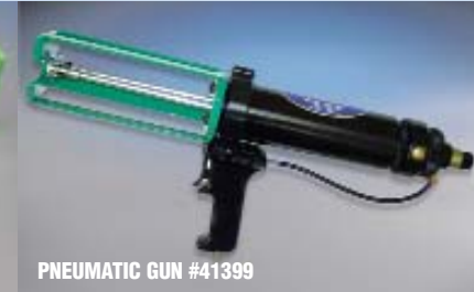
PNEUMATIC GUN #41399