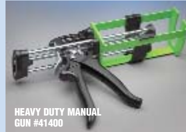
HEAVY DUTY MANUAL GUN #41400

Can be used for either 200 ml. or 220 ml. cartridges.