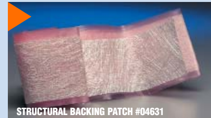
STRUCTURAL BACKING PATCH #04631

Combination of fiberglass cloth, fiberglass reinforcing tape and release film designed to provide additional strength to the repair.