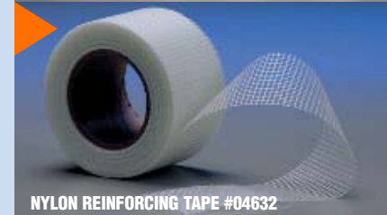
NYLON REINFORCING TAPE #04632

Self-adhesive backing tape for repairing and filling holes and plastic gouges. It can be used for both urethane and epoxy adhesives.