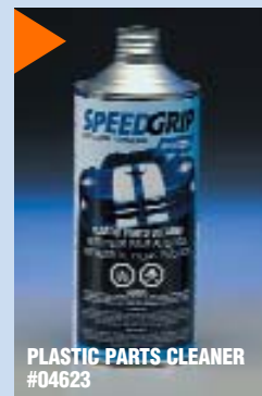
PLASTIC PARTS CLEANER #04623

Selected combination of solvents that remove wax, grease, and silicone from all plastic and rubber parts. This cleaner is safe for use on all types of plastics and does not leave any residue.